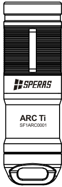
ARC Ti User manual

The Speras Arc Ti is a powerful rechargeable mini key light with a max lumen output of 150lm and a low light of 10lm. It is manufactured from a tough titanium alloy with a double surface oxidation. The flashlight is equipped with the new USB-C port to enable faster charging times. With these features the Spears Arc Ti is a robust and dependable key light which is a perfect companion to add to your Everyday Carry.